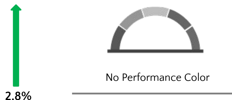
2023 English Learner Progress

27.8 % making progress towards English language proficiency